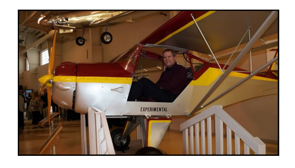
Thanks for Flying with us!